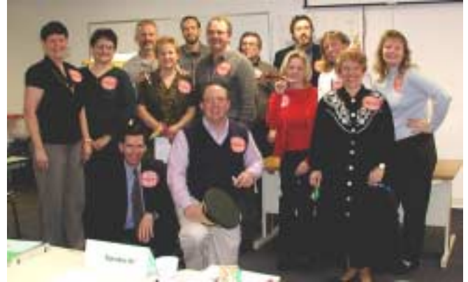
Miranda Toastmasters Club Members

This was a great way to remember members who are not going to be able to attend a meeting for a while. on an extended absence? Consider using a videotape and a little time to show your appreciation. It was fun, and memorable, for the entire Club.